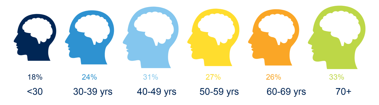
Based on a 2018 Perpetual survey of 3000 Australians.